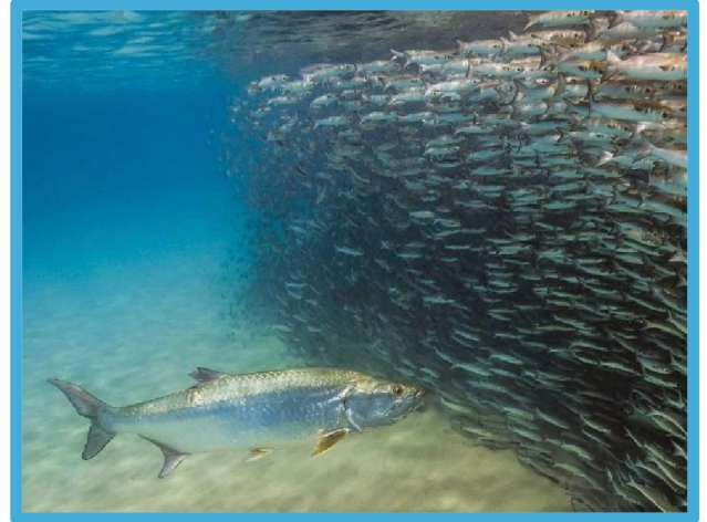
An adult tarpon attacks a school of silver mullet, a forage fish species that is important in a tarpon's diet.

fight when they get hooked. A tarpon is an athlete in the water, leaping and jumping through the air trying its best to get rid of your hook and not get caught. These giant leaps are part of what makes this fish such a prized catch by anglers around the world.