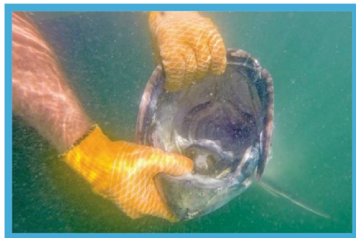
Tarpon use their huge bony mouths to inhale large fish, crabs, and shrimp. The larger the mouth, the larger the food.

The number of tarpon in the ocean has gone down over time because other countries still catch them for food, and because sometimes anglers do not treat them well and the tarpon die during fishing. This is why Florida has laws to protect them, and why the laws ask anglers to release them. But tarpon are a difficult fish to protect, because they can travel long distances and they are found all over the warm parts of the Atlantic Ocean. There is only one species of tarpon ( Megaloops atlanticus ) in the Atlantic Ocean. This means that tarpon caught in South America, the Gulf of Mexico, The Florida Keys, or even along the west coast of Africa are all probably related. This is really