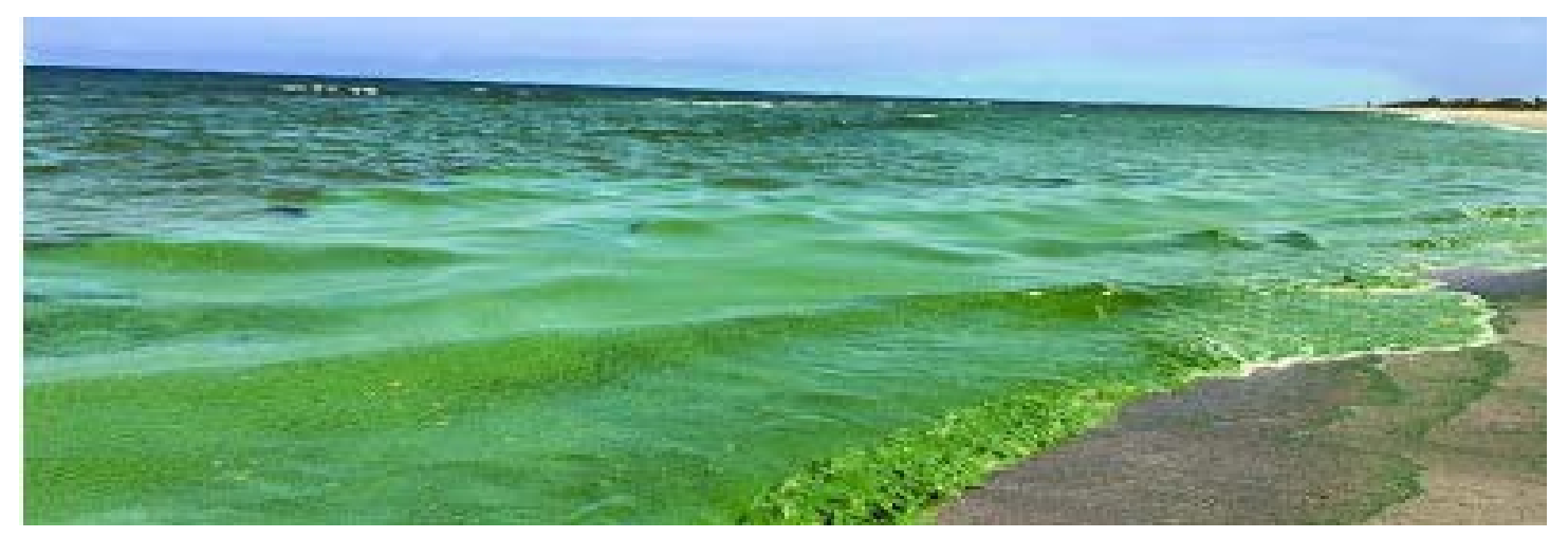
A cyanobacteria species found in freshwater reacts to saltwater by increasing cell production and toxins, thanks to local nutrient sources including sewage.

Evolutionary plasticity allowed these ancient species that cause harmful algal blooms to persist in low levels of abundance. At low levels of abundance they aren't harmful. However, given warm water and enough nutrients, they can bloom and make the water and air toxic.