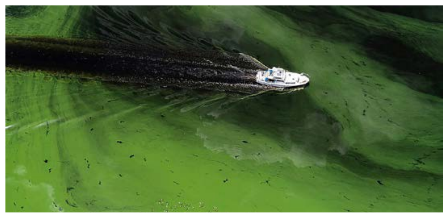
Boating and fishing make up two of the Florida's most powerful economic engines. But HABs including Cyanobacteria blooms (pictured) are causing lasting damage to the economy.

The region's hydroperiod has long taken place between May through October. That's when thundershowers build through the heat of the day and drop heavy but brief summer rainfall. During late summer and early fall, Florida also experiences decaying tropical low-pressure systems and occasionally landfalling tropical cyclones that dump tremendous amounts of rain. Intense rainfall keeps the ground saturated, and causes lakes, creeks and rivers to overflow, driving water downstream and downhill toward the coasts.