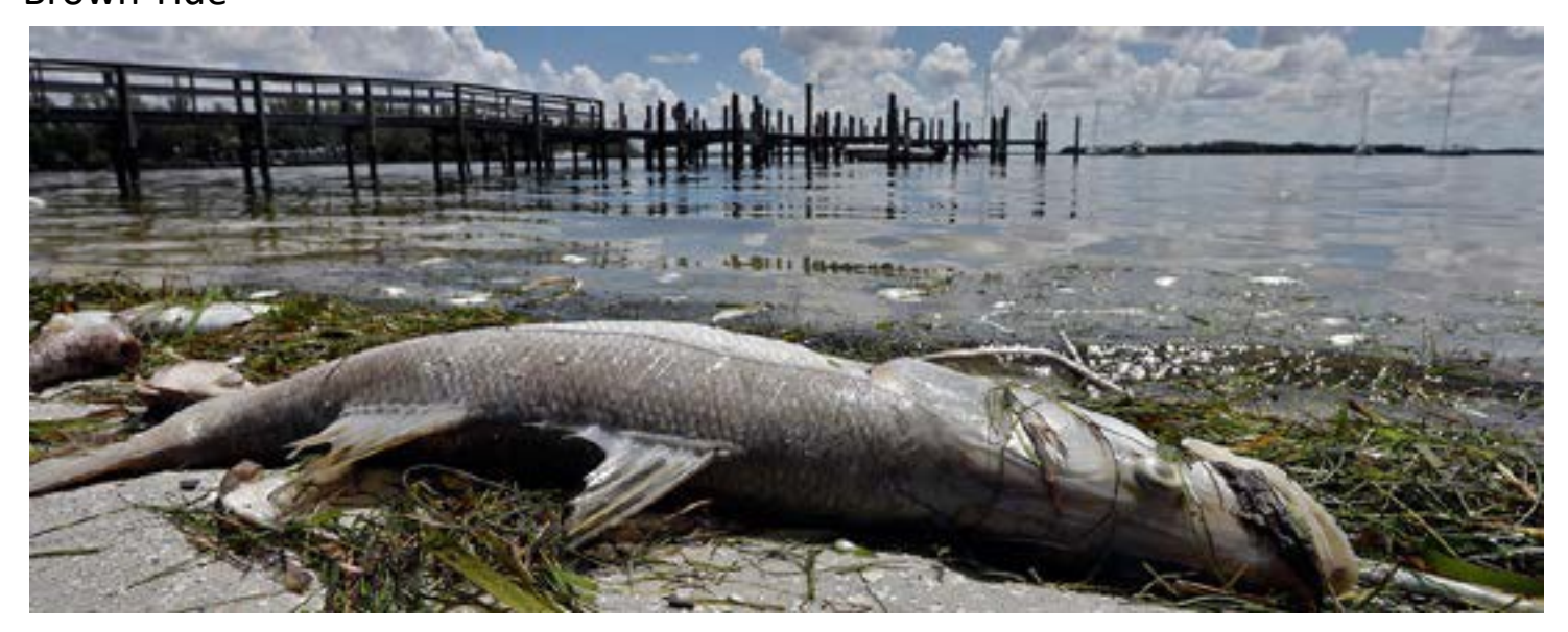
Brown tide has caused repeated major fish kills, decimating fish populations in Florida's Indian River Lagoon.

Brown tide ( Aureoumbra lagunensis ) is a relative new-comer among harmful algal blooms to Florida waters, and has become problematic in the northern and central Indian River Lagoon (IRL) ecosystem along Florida's east coast. Brown tide blooms have disrupted ecosystems in the other shallow estuaries of the US, including Long Island, New York and Texas. Suddenly, during the summer of 2012, a dense brown tide occurred in the Mosquito Lagoon and northern Indian River Lagoon on Florida's east-central coast. Hypereutrophic conditions, thanks to nutrient pollution, allowed it to thrive.