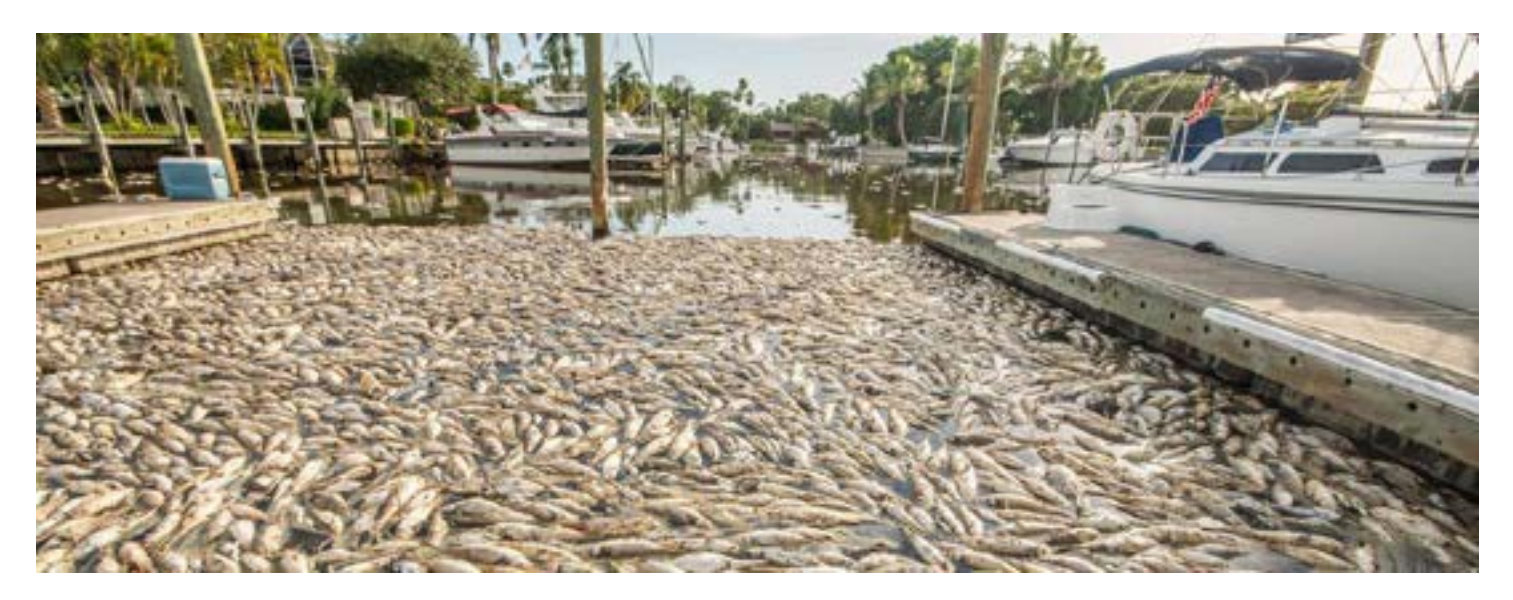
Boating and fishing make up two of the Florida's most powerful economic engines. But HABs including Cyanobacteria blooms (pictured) are causing lasting damage to the economy.

especially during the rainy season, when runoff deposited minerals, phosphorus, and nitrogen-rich detritus into the typically crystal-clear springs. Thanks to Florida's porous, karstic geology, underground rivers flowed through soluble limestone caverns that hydrologically connect Florida lakes and offshore upwellings—places where freshwater bubbled out of springs beneath estuaries and from the bottom of the sea. In fact, the springs flowed so strongly that sailors and fishermen restocked their drinking water supplies by the bucketful from offshore springs. The same springs probably also played important roles in delivering enough nutrients to support the species that cause harmful algal blooms, sometimes triggering events like red tides.