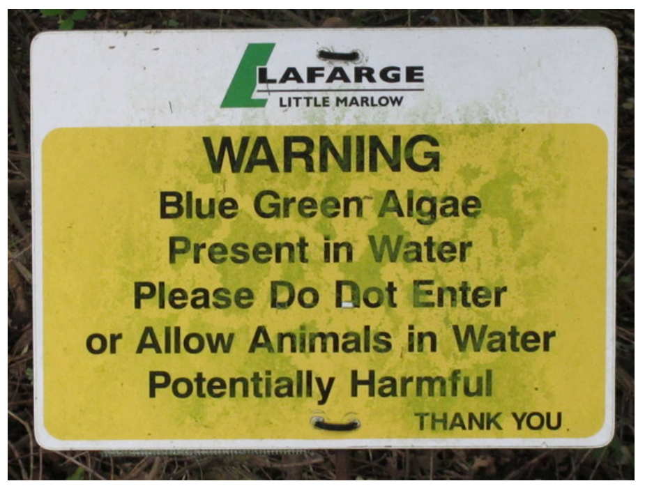
Harmful algal blooms are not just happening in Florida. They can occur anywhere that pollution causes too many nutrients to enter the water.

You may have heard and been puzzled by officials saying that the species that cause harmful algal blooms are "naturally occurring," and that HABs such as red tide have occurred throughout history. It's true that these species are naturally occurring and, in the past, have caused some HABs. But it's only part of the story, especially in this latest chapter in earth's history. We live in a geological epoch that many experts are calling the "Anthropocene," because ours is a time when human activity, including air and water pollution, is the dominant influence on climate and the environment.