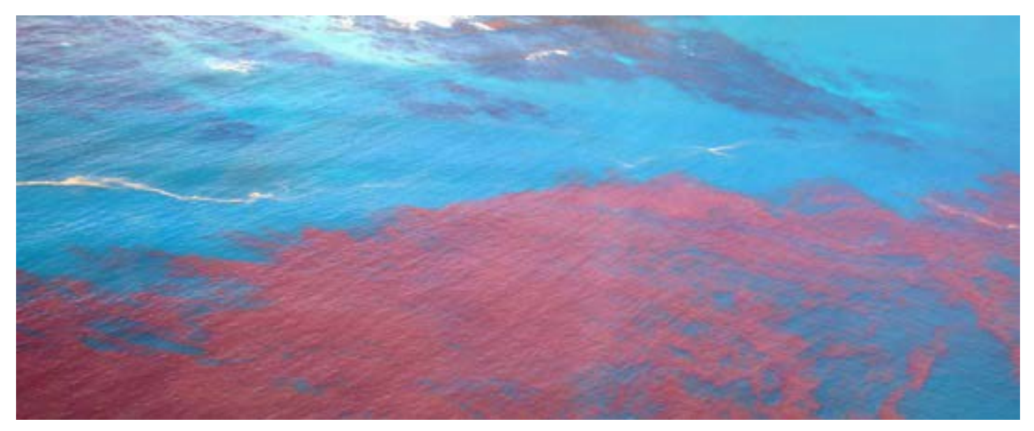
Karenia brevis, like other organisms that cause HABs, is always present in the water, but only "blooms" when conditions are right.

Karenia brevis earned its "colorful" moniker because of the rusty hue that intense blooms give to normally blue/green coastal waters. The cells contain reddish photosynthetic pigments – an adaptation that allows them to survive deep on the ocean floor where the blooms originate, and where there is little penetrating sunlight. It is one of many adaptations that make this toxic species of dinoflagellate so remarkably persistent and dangerous. Always searching for its photosynthetic sweet spot, K. brevis has the ability – thanks to its flagella – to alter its depth in the water column and find the light levels that allow it to reproduce optimally.