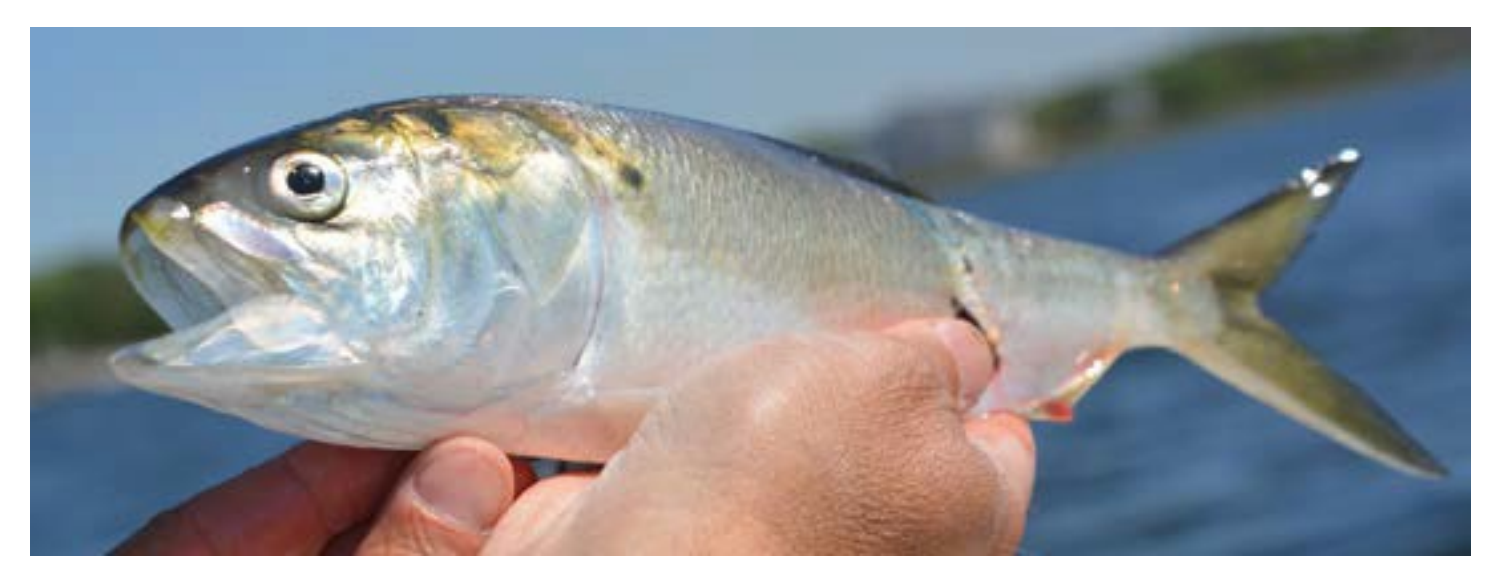
Because Atlantic menhaden are abundant in many different places, they are called by many different names. The scientific, or "universal" name is Brevoortia tyrannus , but across the East Coast they are fondly referred to as menhaden, pogy, bunker, and even bug-head after the parasitic isopod often found on (or replacing) their tongue.

Menhaden are called "the most important fish in the ocean" because as "filter feeders" they sift plankton out of the water at a rate of four gallons of water per minute, cleaning the water while the plankton enriches their bodies. As a planktivore, menhaden offer larger fish and cetaceans (marine mammals such as dolphins and whales) an incredibly rich source of fats and proteins.