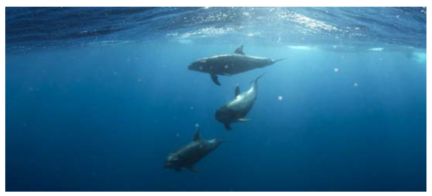
The toxins produced by HABs are strong enough to kill even the largest, toughest marine mammals, including bottlenose dolphins.

Of course, untold species of cyanobacteria persist today and occur naturally in fresh-, brackish- and saltwater. The species come in many colors, shapes and sizes. The most infamous, however, are the bright, blue-green-colored species that make national headlines as they blanket and poison legendary water bodies including the Great Lakes; Florida's Lake Okeechobee; the St. Lucie Estuary; the Caloosahatchee River; and parts of the St. Johns River.