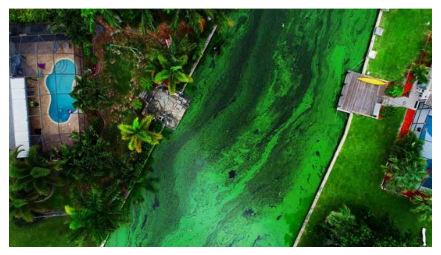
Toxic cyanobacteria paints the surface of a South Florida waterway. Wastewater, including raw sewage and septic tank effluent fuel

armful algal blooms (HABs) are defined by the US National Oceanographic and Atmospheric Administration as "Harmful algal blooms (HABs) occur when algae — simple photosynthetic organisms that live in the sea and freshwater — grow out of control while producing toxic or harmful effects on people, fish, shellfish, marine mammals, and birds. There are many kinds of HABs, caused by a variety of algal groups with different toxins." HABs occur virtually worldwide in coastal ecosystems, in freshwater bodies such as the Great Lakes, and in stagnant, nutrient-rich, oxygen-poor backwaters. The organisms that cause HABs have been on the earth far longer than humans have, but in today's world, these organisms undergo population explosions. They become harmful due to human activities that provide sufficient volumes of