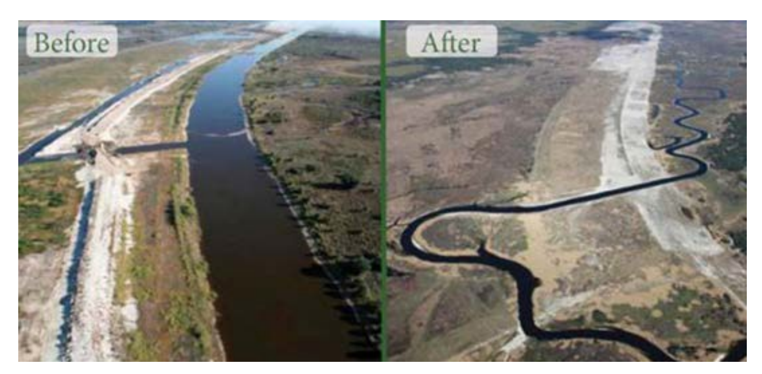
Before and after images show an aerial perspective of one of the largest aquatic restoration projects in human history.

The straightening of the mighty Kissimmee River, which connects a series of more than twenty-four lakes between Orlando and Okeechobee as part of the Everglades ecosystem, is an example of how dramatically the alteration of natural water flows – combined with anthropogenic nutrient pollution – changed the health of Lake Okeechobee. Historically, the Kissimmee River meandered 103 miles from Lake Kissimmee to Lake Okeechobee through a one-to three-mile-wide biodiverse wetland floodplain. Because natural wet-season flooding threatened agriculture and development, the Kissimmee River between 1960 and 1971 was transformed into a 56-mile-long ditch—300 feet wide and 30 feet deep – known as the C-38 canal. The canal forced water to flow swiftly and directly south, denying the floodplain—the low, vegetated areas along the river's banks— the opportunity to capture increasing nutrient pollution from sprawling urban development and agricultural operations nearby.