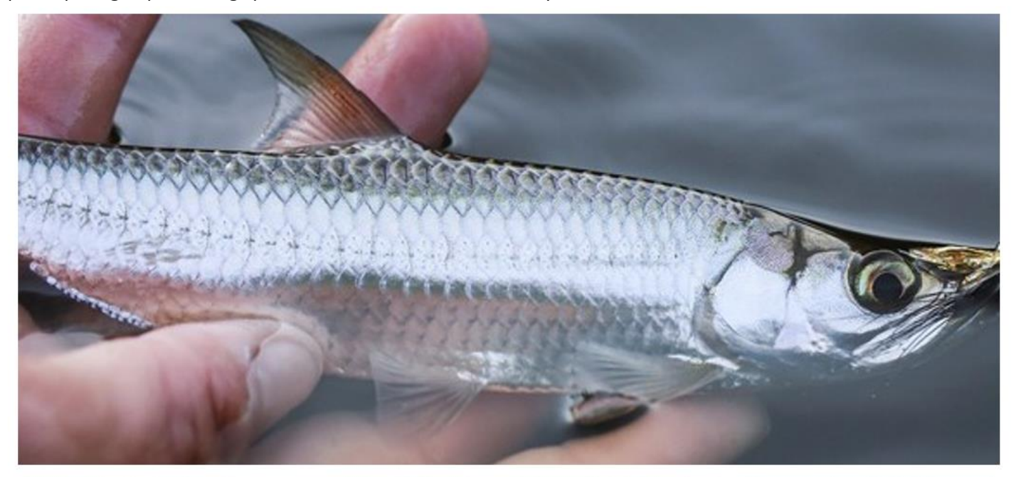
Anyone who finds a juvenile tarpon can report the location and date, which helps scientists figure out juvenile habitats and learn about spawning seasons.

Also, once preferred habitats are identified, scientists and citizens then work together to identify special areas of concern that may require additional protections or are ripe for habitat restoration. Restoring habitats is the next level of citizen science that allows citizens to actually get dirty and rebuild lost or degraded habitats, fully participating in protecting species and the waters where they live.