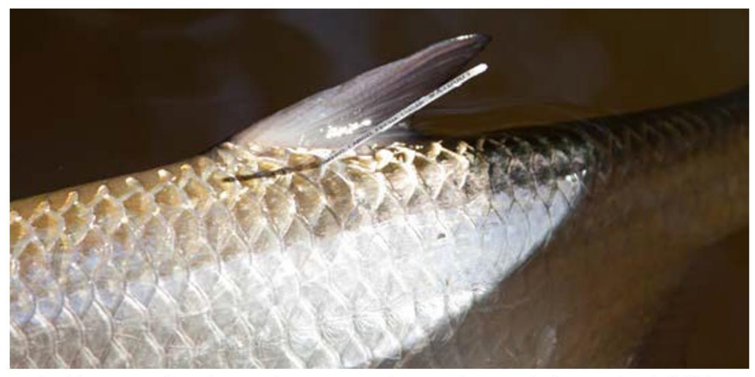
Anglers help scientists understand tarpon and permit migrations by inserting dart tags with information about the fish below the dorsal fin.

Between dart tags and acoustic tags, scientists are able to get a pretty reliable picture of when and where permit are swimming on a regular basis, and it wouldn't be possible without citizen scientists. Scientists share the collected information, and get a better understanding of the environmental conditions and paths that fish use. Over time, a database creates a picture that can even help scientists understand if there are other things going on that may affect migratory behavior. This information is critical for fisheries managers, so that they can act to ensure enough spawning age fish are protected across enough range to ensure reproduction and a healthy fishery.