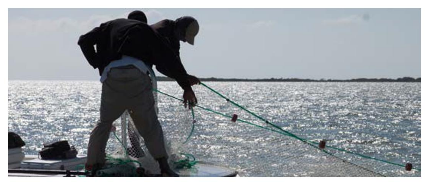
Anglers do the hard work in a research effort involving catching fish in seine nets and landing the fish so they can be tagged, sampled, and released.

habitat, or other imbalances in the ecosystem. Community involvement gives scientists "insider" information that can increase the understanding of the area. This perspective is critical for developing a better understanding of the place or system being studied, and contributes to the more traditional principles of science. It is sometimes called, "local knowledge," or more formally as " traditional ecological knowledge ."