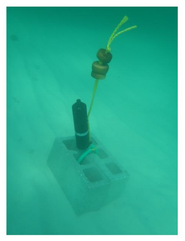
An acoustic receiver is anchored to the ocean floor and held upright with a couple floats.

Acoustic tags are surgically implanted devices that use technology to track a fish's movements. These tags work similarly to a Sunpass that cars in Florida use as they pass by toll stations on the highway. Each tag has a unique identification (ID) code that is recorded by "scanners" called acoustic receivers that are anchored on the ocean floor all across the U.S. East Coast, throughout the Keys, and around The Bahamas. Every time an acoustically tagged fish swims past one of these receivers, the receiver it passed picks up and records the ID number of the fish,