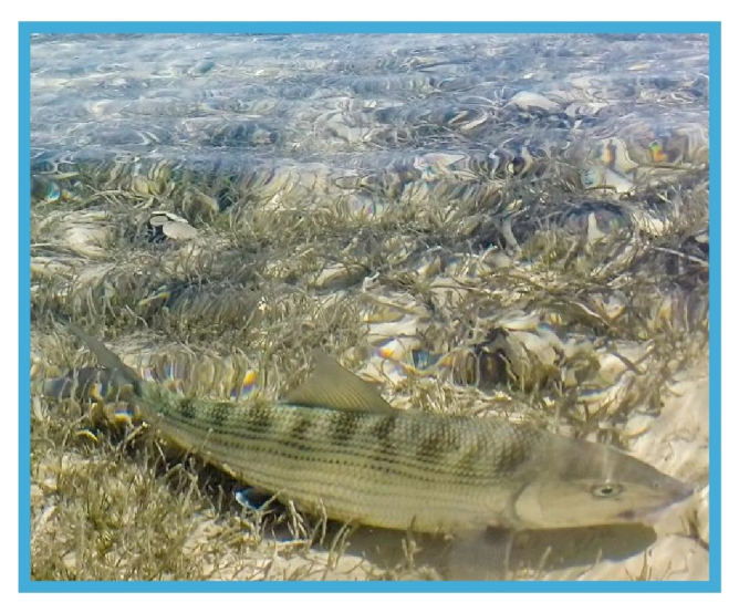
Silver scale and dark green streaks help the bonefish blend in on the grass flats where they feed.

Though researchers aren't quite sure why, large juveniles and sub-adults live mostly on open sandy bottoms in deeper water than where anglers tend to fish for adults. Large juveniles and pre-adults dominate many of the large 'muds' of bonefish. Muds are large areas, often an acre or more, of muddy water that is caused by feeding bonefish as they root into the bottom in search of prey, suspending sediment in the water.