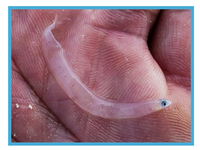
Bonefish leptocephalus are thin and translucent as a camouflage during their open-ocean

Their translucence served them well in those acidic times; it continues to provide them protection in the clear and relatively barren tropical oceans of today. It may serve them well in the future as our oceans become more acidic again due to oceans' abilities to absorb human-induced carbon dioxide