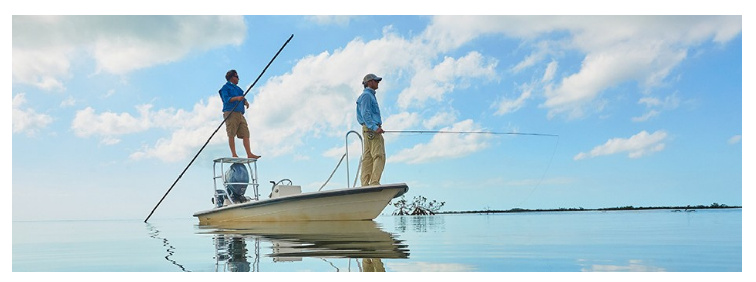
A fly fisherman and professional fishing guide look for bonefish.

DNA testing allows researchers to piece together how populations of bonefish in one area support those in other areas. Without it, researchers can only get a sense of population connectivity by studying the speeds and trajectories of ocean currents.