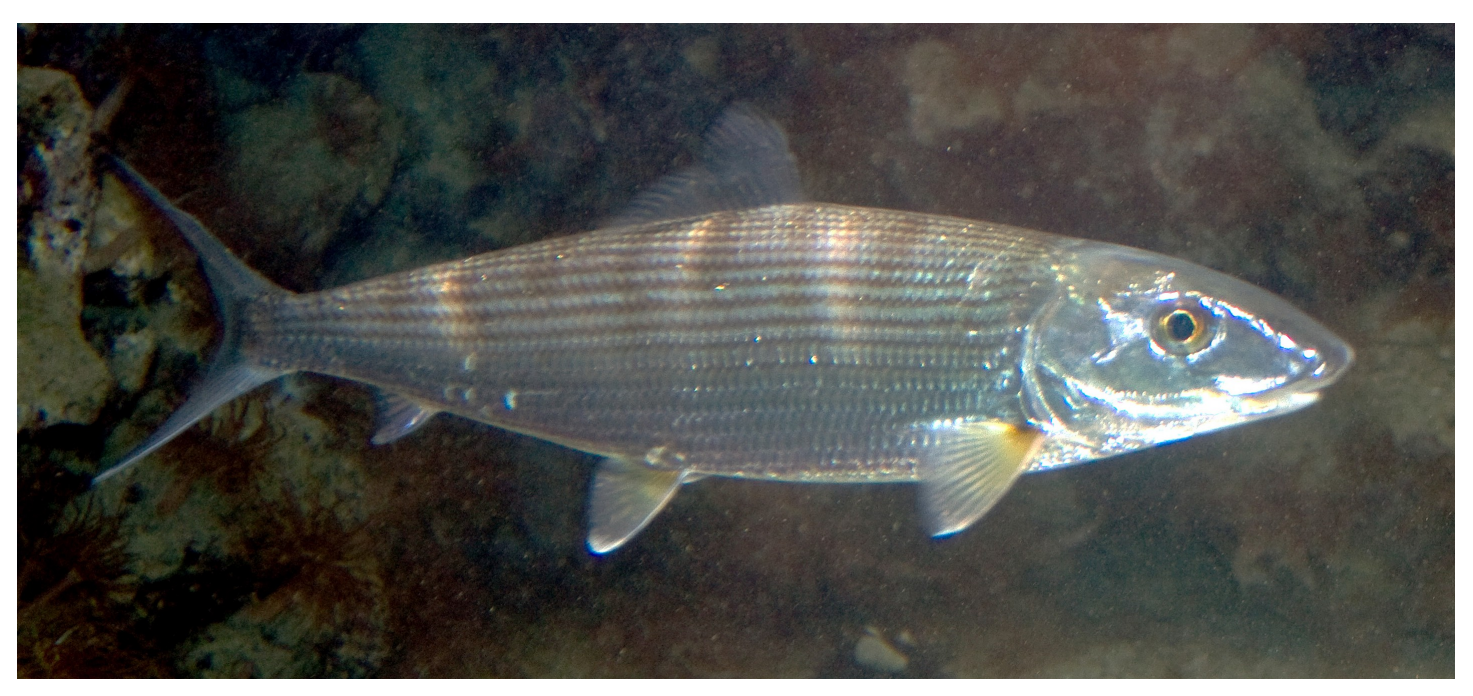
The most popular bonefish species in Florida and around the Caribbean is Albula vulpes, known as "the white fox."

Globally, scientists have identified twelve species of bonefish. Though subtle physical differences can distinguish the species, genetic information provides evidence of different species, as well as indications of kinship between sub-populations of the same species.