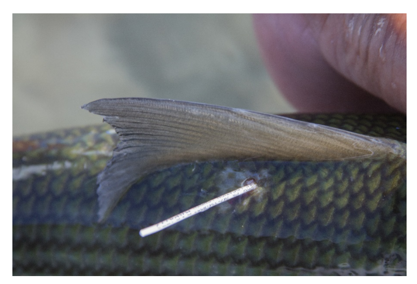
Spaghetti tags are used for catch-and-release studies, where fishermen who catch the fish again will call the number listed on the tag and report information about where the fish was caught and how big is it. You can see where the name comes from!

The first type of tag that researchers and fishermen used for this study was a spaghetti tag. Spaghetti tags are attached just under the skin of the fish next to the dorsal fin. These tags have unique numbers, and contact information of the researcher printed on them so that if/when the fish is recaptured, scientists can learn where it was caught.